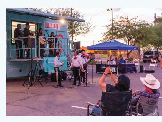
A mariachi band performs on the stage of Soundbite at the Guadalupe library.