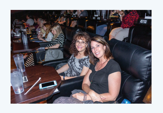
Movie Club members enjoy an exclusive film screening together.

...listened to 41 hours of music on the KBACH To Go flash drive and 261 hours of pledge-free streaming on KJZZ Plus