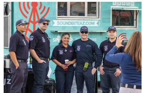
Above: Members of the Gila River Fire Department pose in front of Soundbite.

In June, Soundbite and KJZZ staff visited 21 first-responder stations across Maricopa County, acknowledging their service to the community. The Short Leash Doughnuts and Press Coffee that were served, along with our sincere thanks, had a lasting impact on more than 1,000 emergency, fire, police, and National Guard personnel who were honored by Soundbite visits.