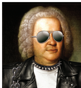
Above: One of K-BACH’s recent billboards that appeared across the Valley this year.