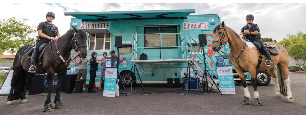
Left: Two Tempe police mounted officers display two of the department’s seven horses.